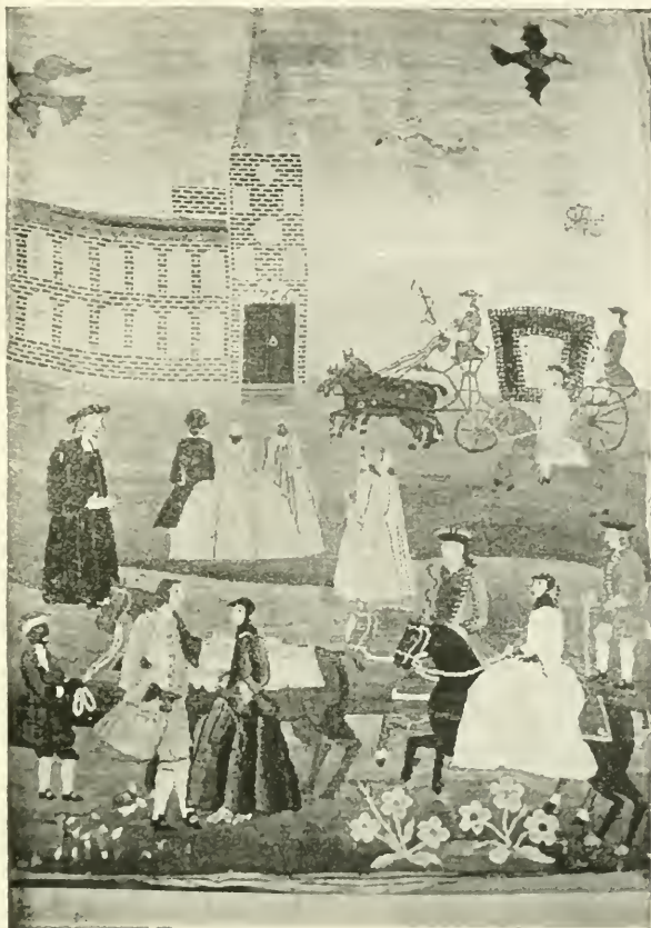
WEDDING PARTY IN BOSTON IN 1756